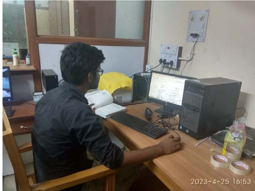
Creating and managing Integrated Library Management System (ILMS)